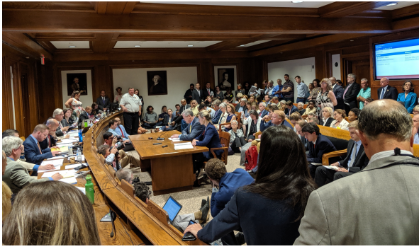
Governor Baker testifying before the Joint Committee on Revenue in a crowded room

Governor Charlie Baker filed a measure to raise taxes on real estate transfers to generate ~$137 million annually for infrastructure and climate resiliency programs. Sierra Club supports a further real estate transfer increase to also provide much-needed revenue for affordable housing.