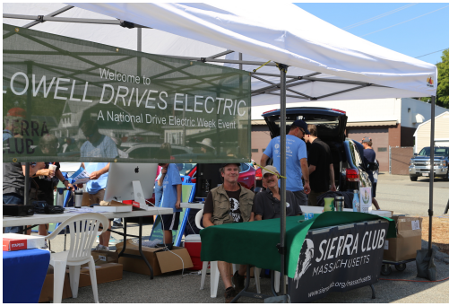
Merrimack Valley Team members in Lowell

Hyannis , organized by our friends at Cape Air and the Green Energy Consumers Alliance.