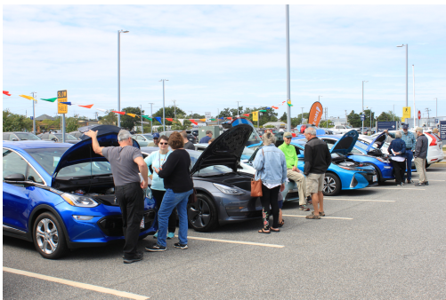
Electric vehicles on display on Cape Cod.