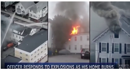
OFFICER RESPONDS TO EXPLOSIONS AS HIS HOME BURNS NIGHTLY NEWS