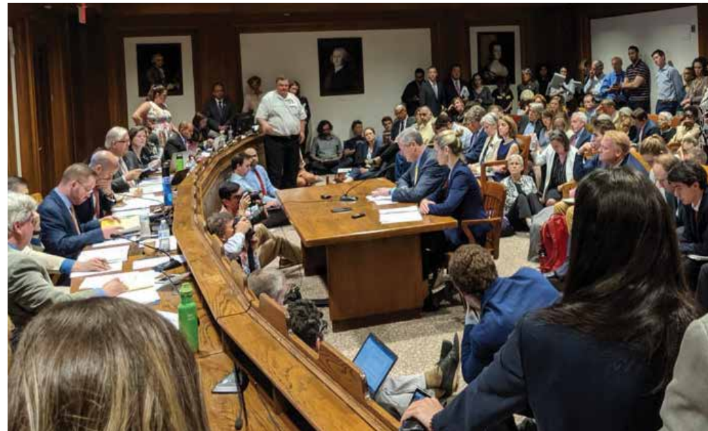
Governor Baker Climate Change Adaptation bill hearing on June 18, 2019

Eight of the nine members of the Massachusetts delegation in the U.S. House have indicated their support for comprehensive clean energy and climate policies by co-sponsoring the Green New Deal resolution authored by Rep. Alexandria Ocasio-Cortez of New York and our own Sen. Ed Markey. However, at the state level our current leaders in the Massachusetts House of Representatives have been unwilling to pass legislation that comes close to addressing the urgency of the climate crisis.