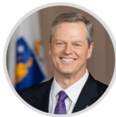
Charlie Baker Massachusetts Governor