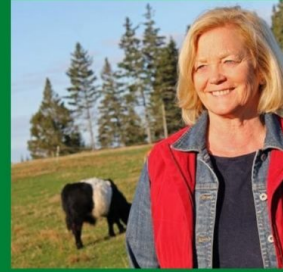
Rep. Chellie Pingree

Join us on Zoom and learn from our panelists how collaboration between citizens & governments can restore our planet