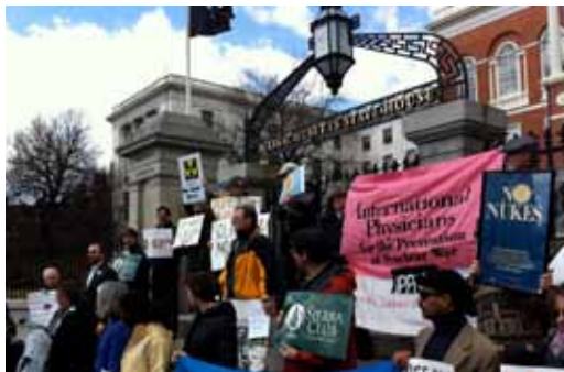
Citizen, Public Safety, Anti-nuclear, and Environmental Groups organized on the steps of the statehouse to educate the public about the dangers of nuclear power in the wake of the Japanese Tsunami.