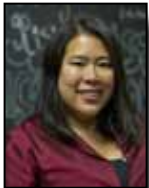
Lisa Wong Mayor Fitchburg

Since Lisa Wong's first election, she has been a champion of increasing public transportation options and use and