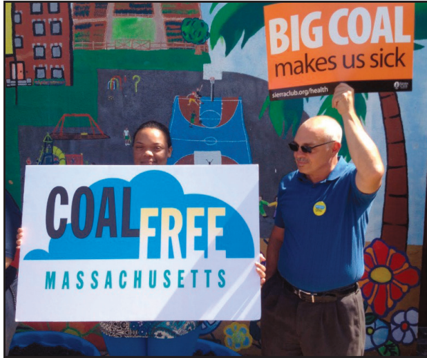
Activists rallied in Holyoke and around Massachusetts to phase out coal by 2020 and protect public health.

The Sierra Club, in close partnership with a coalition of environmental, public health, faith and community groups, elected officials, and local citizens launched a new campaign this summer to protect public health and communities, renew efforts to make the transition to energy efficiency and clean renewable energy sources, and revitalize local economies to create more jobs.