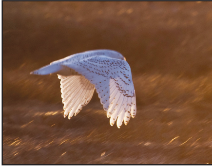
Snowy Owl Downbeat