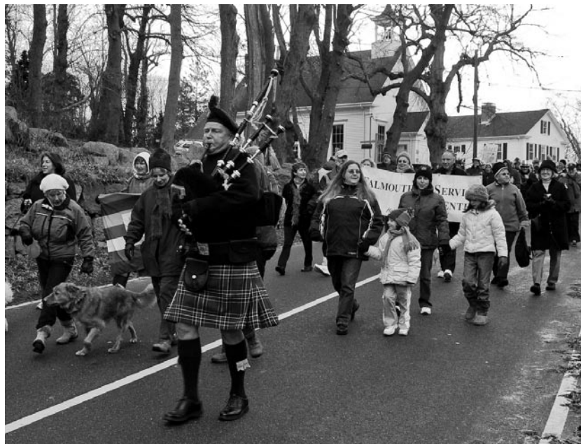
The Toast to the Coast Holiday Parade

New Year's Day gatherings in Woods Hole have become a tradition for both the Sierra Club and for residents of Cape Cod and the nearby islands since the Sierra Club held the first of its January "Toast to The Coast" events in 2001. Community people gathered at the ocean's edge to make their New Year's Day resolutions to help protect each other and