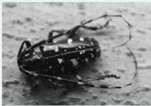
Asian Long Horned Beetle

One of the threats to our forests comes from people moving firewood from one region to another. Why? Because many non-native insects and diseases can be in that firewood, and survive the trip. According to Faith Campbell of The Nature Conservancy, the emerald ash borer, Asian longhorned beetle, gypsy moth, beech bark disease, and the sudden oak death pathogen can survive in firewood. The Sirex woodwasp is likely to be transported in pine firewood. All of these pests are dangerous to our woodlands.