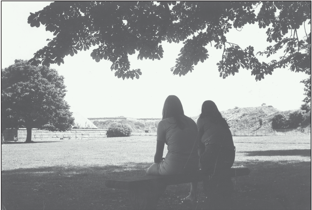
Taking a break... 1975. Ft Warren is seen in the background as visitors stop to rest on George's Island. The Boston Harbor Islands National Recreational Area was later established in part due to the tireless efforts of New England Sierra Club activists.