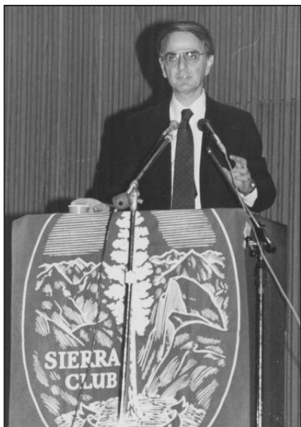
Carl Sagan addresses more than 600 Sierra Club Members in 1987 at an event discussing the impacts of nuclear arms.