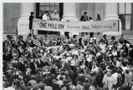
Political Activists Call for Watt’s Resignation

Many important environmental issues you’re reading about in this Sierran, as well as many others, will be decided in this legislative session. The Committee hopes that you, as someone who clearly cares about the environment, will find some time to help elect pro-environment legislators. You can make a big difference in an election by volunteering. We urge you to support our endorsed candidates! If you have questions about the endorsement process, or can help elect environmental candidates, contact cpc@sierraclubmass.org .