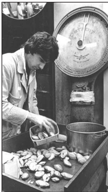
Sorting clams in 1977. The Sierra Club has been active on fisheries issues in New England for decades.

In response to the resulting decrease in living marine resources (LMRs), in the early 1990's the Massachusetts Chapter asked the Cape Cod Group to help them develop a "sustainable fisheries" pol-