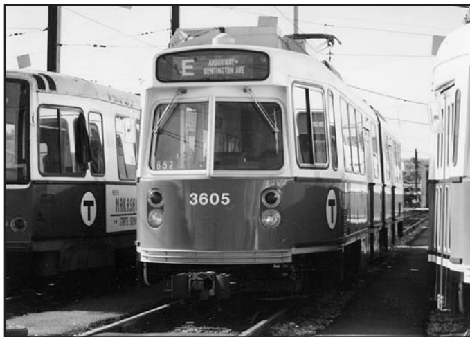
Chapter volunteers and staff continue to work together to promote safe and affordable public transportation for all.

Sierra Club calendars and books can still be found in your local bookstore, but the Club itself, and the impact of our work, can be felt even more places now than ever. Today