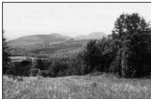
The Club was instrumental in protecting Greylock Glen from development in both the 1980's and again in the late 1990's. Most of what is shown in this photo would have been developed as a ski resort or vacation homes.

As people who often enjoy recreating in the wild areas of our neighboring states, we worked to help create wilderness areas in the White and