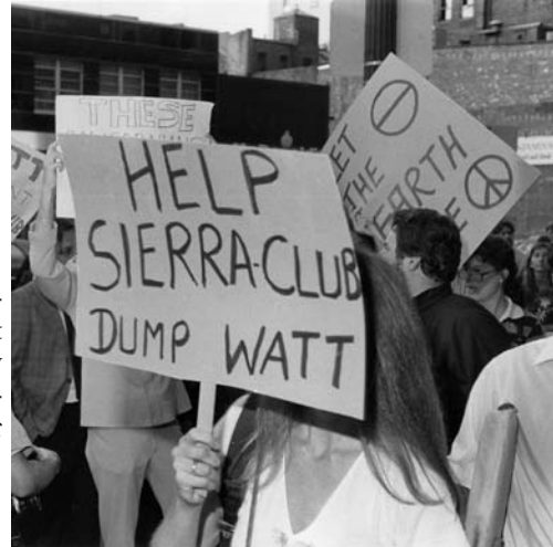
Getting to Scale... Thousands of Sierra Club Leaders organized to oust “James Watt” - a proponent of opening all public lands to oil and gas drilling - in the early 1980’s. Environmental groups collected over 1 million signatures.