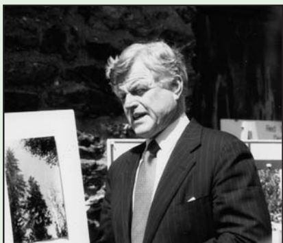
Senator Kennedy talks to Club members about Acid Rain in 1989 on the summit of Mt. Greylock.

Many shoppers regularly look for certain symbols or words to guide them. In the produce aisle they often look for “organic” or “local.” For coffee and other items many seek out “fair trade.” If they don’t see those words, they usually won’t buy the item.