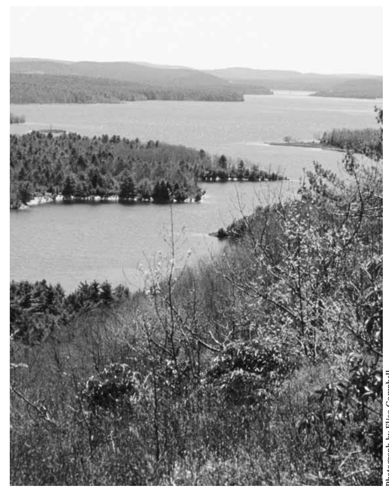
Quabbin Reservoir from Rattlesnake Hill in New Salem

The first beef is political: With 75 customer communities, the MWRA could become an unstoppable force in the legislature. This worries western Massachusetts folks because they, in the end, will pay the price if even more water is sought in the future. The second beef is priority: