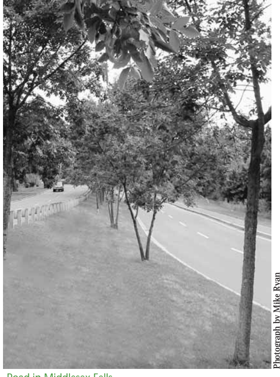
Road in Middlesex Fells

For example, if the proposed development of a 40.7-acre site surrounded by the Middlesex Fells Reservation is approved, it will add up to 8,000 daily car trips on the Fells parkways. There would be severe pressure for modifying the parkways such as widening roads, adding turning lanes, striping crosswalks, cutting trees, removing medians, and signalizing intersections.