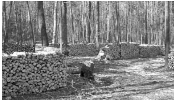
Piles of firewood on Weston conservation land.

Making this work will require adherence to a few basic ecological and social principles. We need substantial wild areas at every scale, but also an understanding that most (though not all) of the values that are associated with wild forest can also be found