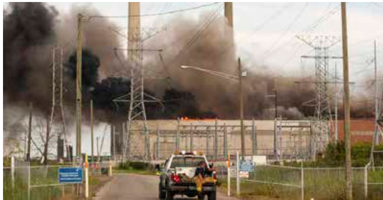
Fire engulfed St Clair Plant on August 11. Plans to shut down the plant were long overdue.

For more information about Michigan’s Beyond Coal Campaign, visit www.sierraclub.org/michigan/beyond-coal .