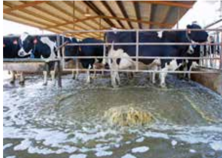
JEFF VANUGA, USDA/NRCS

The November 2015 report by Sierra Club's Less=More coalition, "Follow the Manure: Factory Farms and the Lake Erie Algae Crisis," vividly demonstrates the link between factory farms and Lake Erie's algae problem and the role taxpayer dollars play. It features interactive maps depicting the location of 146 factory farms in the western Lake Erie watershed with the amount of waste generated, environmental violations incurred and federal