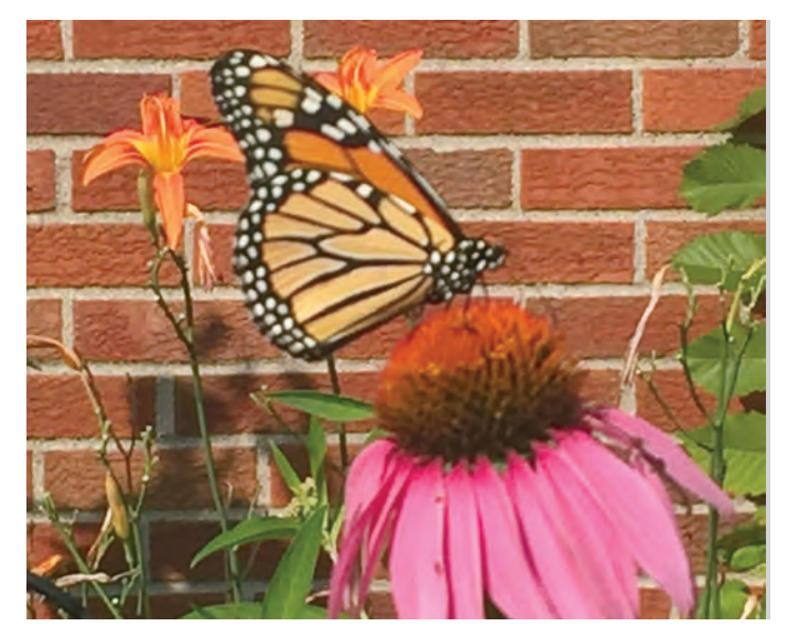
Coneflowers and butterflies in a Detroit rain garden add beauty while the garden helps clean water.

Due to aging infrastructure and more intense storms due to climate change, the Detroit Water and Sewerage Department's system, now operated by the Great Lakes Water Authority, has discharged billions of gallons of combined sewer overflows (CSOs) into the Detroit and Rouge Rivers. But, the good news is the amount of CSOs has been significantly reduced through