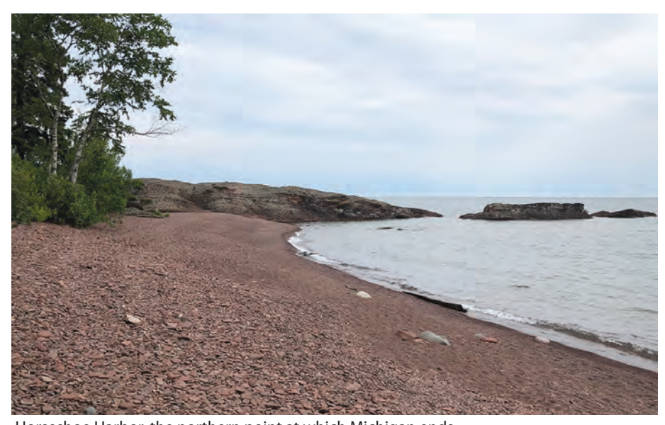
Horseshoe Harbor, the northern point at which Michigan ends.