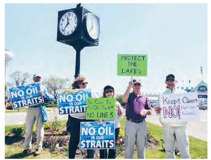
Volunteers spoke out in favor of decommissioning Line 5 at the Schuette Shutdown rally in July.