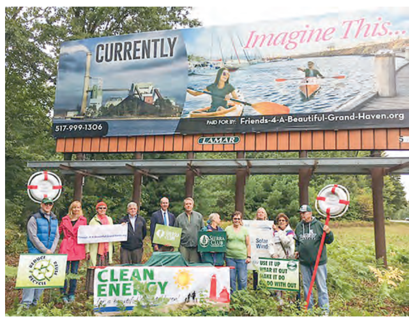
Local activists standing under the billboard.

his past summer, the Grand Haven City Council and the Board of Light and Power (BLP) held a facilitated meeting regarding an analysis and assessment by Black & Veatch (an 11-member consulting team that was also the original design engineer of the Sims Plant). The Black & Veatch assessment team findings determined that $35 million would be required to continue safe and reliable operation of Sims. The report stated that the plant is basically old and worn out and that