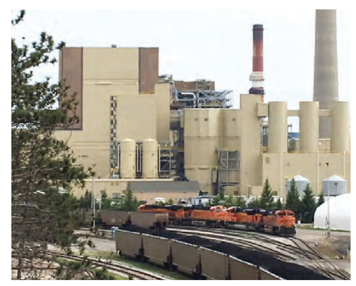
The Karn retirement is the 270th coal plant retired or announced to be retired nationwide since the Sierra Club's Beyond Coal Campaign began in 2010.

The future of Consumers' largest polluter, the JH Campbell