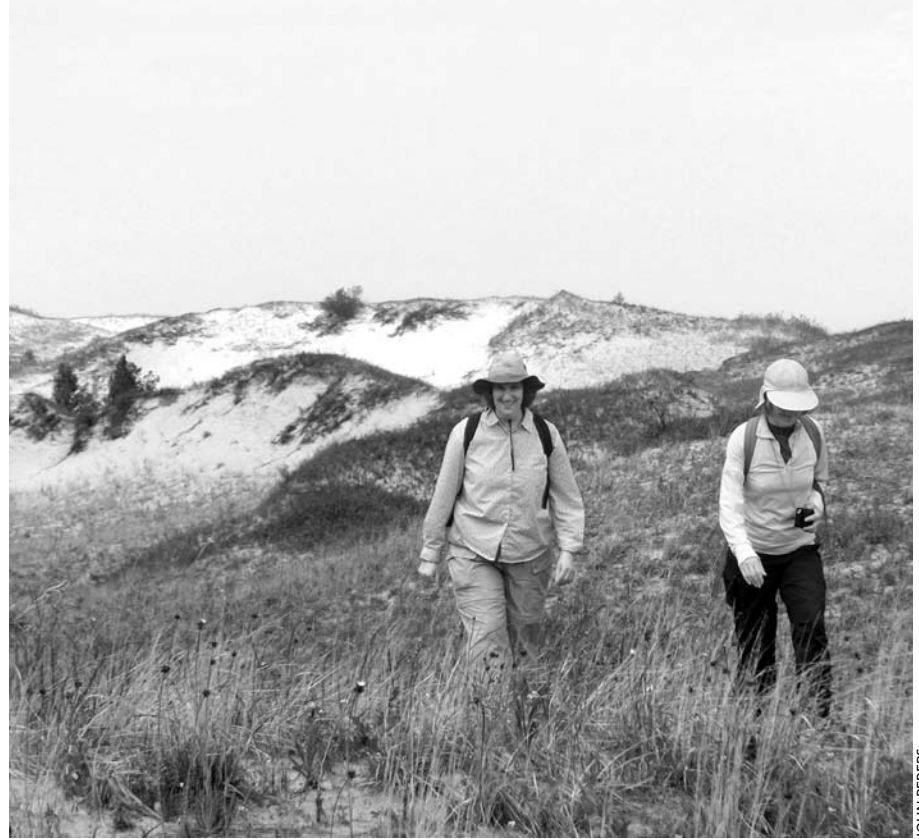
Hiking Grand Sable Dunes in Pictured Rocks National Lakeshore along Lake Superior. Sierra Club helped prevent shoreline road development in this pristine park in 1981.

Officeholders at every level of government have the power to protect Michigan's wild places or open them to devel-