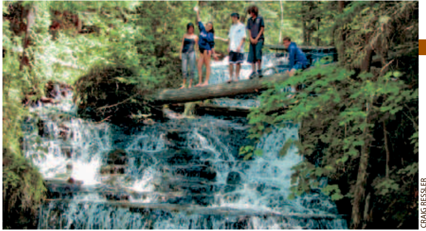
A group of six youths from Grand Rapids enjoyed an Inner City Outing to the Upper Peninsula last summer. Their goal during the four-day adventure was to find a pool at the base of a waterfall to jump into and swim. They didn't make the leap at the location pictured here, but they had success later at Dead River Falls. Group leader Craig Ressler also led them on a hike in Seney National Wildlife Refuge.