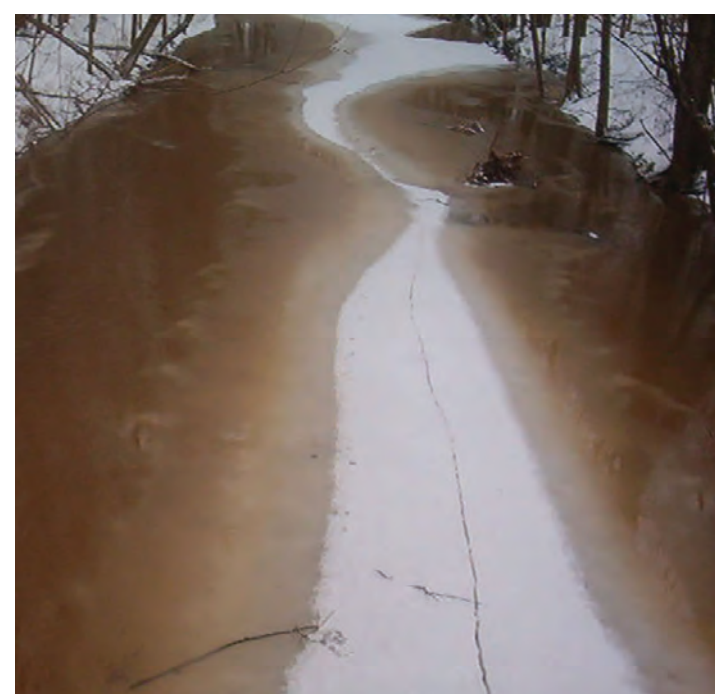
The agriculture industry opposes the new state ban on the application of animal waste on frozen and snow-covered ground from January-March, even though the practice leads to toxic runoff that feeds algae blooms.

The Michigan Environmental Council is heading up a legal response by a coalition of organizations intervening in the appeal process. The Sierra Club is exploring options for a legal response including the possibility of intervening with several other groups in the appeal process.