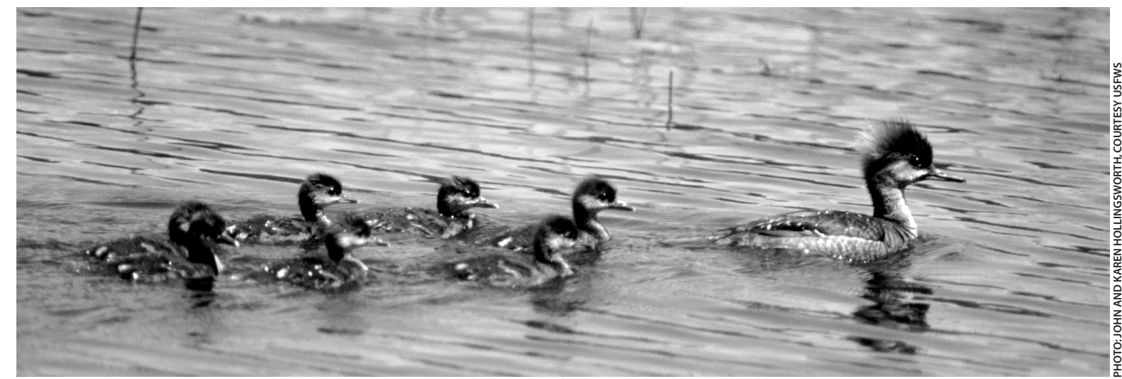
A Hooded Merganser brood at the Seney National Wildlife Refuge

As a Sierra Club member you are a crucial part of this effort, both by supporting Sierra Club's Political Committee through contributions and by volunteering your time to help elect environmental candidates. More than ninety percent of Sierra Club members are registered to vote, meaning you have a power beyond your mere numbers to shape the future of the Michigan Congressional Delegation, Michigan Legislature, Governor and local races. Please take time to review the candidates the Sierra Club has endorsed in the August 6 Primary Election, and join us in making Michigan a better, greener place for the future.