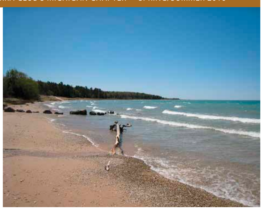
Surrounded by four Great Lakes, Michigan has a special responsibility to protect water.

• The MDEQ's failure to adequately enforce factory farm permits to prevent manure runoff that contributes to