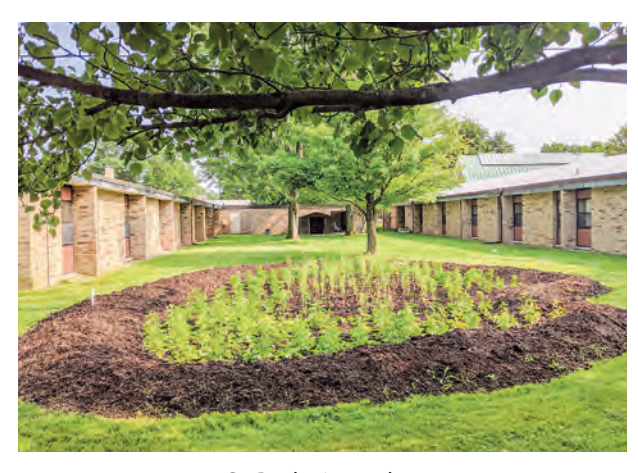
St. Paul rain garden

Now in its sixth year, the Rain Gardens to the Rescue program is a partnership between the Chapter's Detroit-based Great Lakes Great Communities campaign and FOTR. We have installed 70 rain gardens at homes and faith-based organizations throughout the city that treat up to 47,000 gallons of rainwater