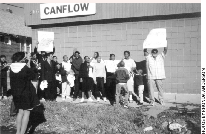
Neighbors demonstrate to stop Canflow operations in Detroit.

A class action lawsuit involving residents has been launched against Canflow. After a presentation to the City Council by the Greendale Community Council, a city planner, acting on a Councilperson's request, put together a report on Canflow operations and previous violations. This induced the city to hold up the permit. As this story went to press, Canflow had just launched a suit against the city.