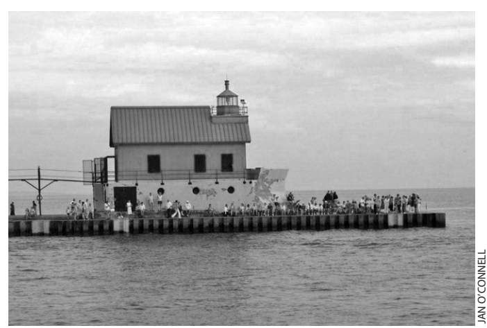
South Pierhead Lighthouse in Grand Haven

Coal-fired power plants produce 40% of the nation's carbon dioxide (CO<sub>2</sub>), one of the main contributors to global warming.