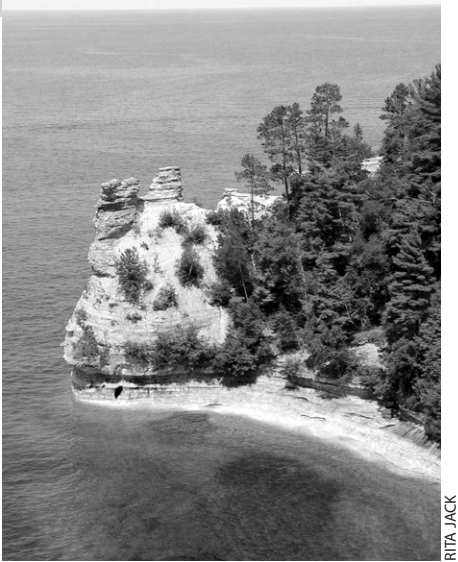
Castle Rock, Lake Superior, Upper Peninsula

condition? We learned through hard lessons that the lakes are not as vast as we thought (and neither are the oceans and the earth itself), and that actions intended for good, like dredging to promote shipping, can have long-term, unintended consequences. Nutrients from lawns, sewers, farm fields and CAFOs have changed the whole ecosystem. We once thought that effluent from smokestacks went up into the air and harmlessly away, but now we know that mercury and other pollutants fall into the lakes and contaminate the very fish that provided sustenance to our ancestors. Shippers heedlessly dumped alien species into the lakes, further degrading the ecosystem. And global warming may even alter the shape of Michigan through changes in precipitation and in-