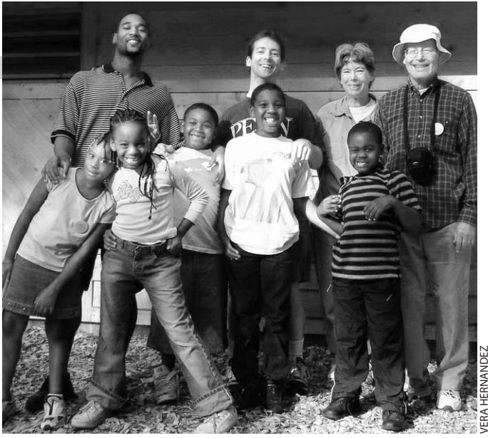
In Washtenaw County, four volunteers have been honored for their commitment to providing youth access to the outdoors on safe and fun wilderness excursions through Sierra Club's Inner City Outings Program.

In January 2009, four certified leaders with Washtenaw Inner City Outings (WICO) received recognition from the national Sierra Club's Inner City Outings program. Each leader received a pin marked "ICO 5" which means they have been consistently leading ICO outings for five years or more. Recognized leaders