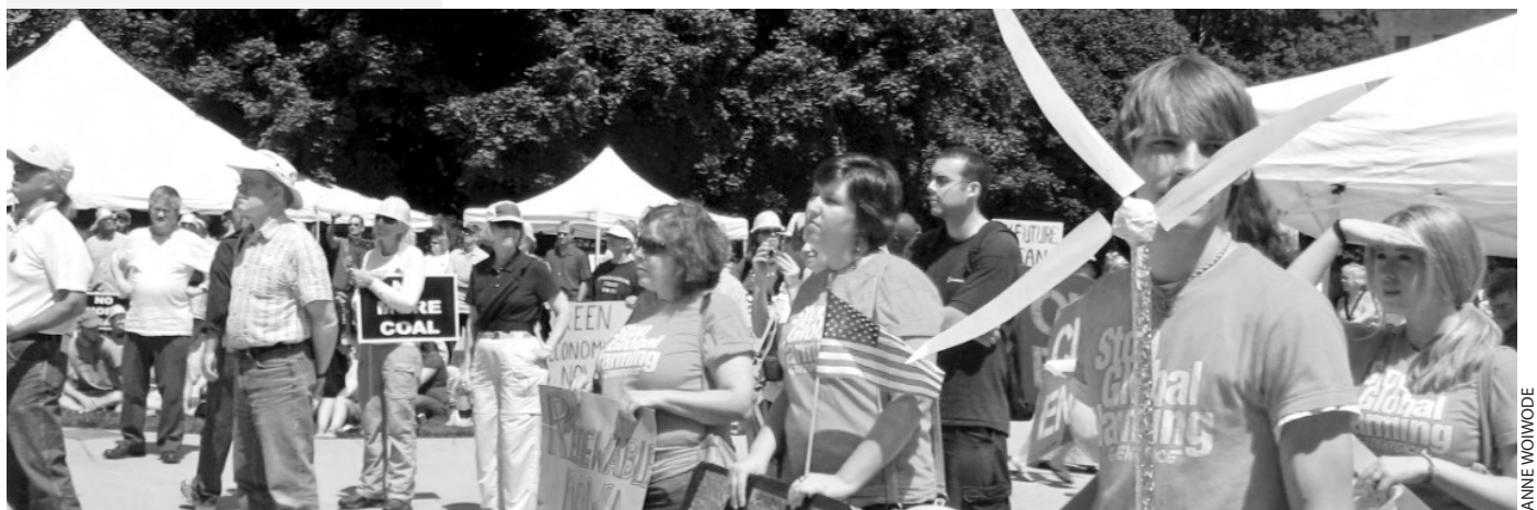
Clean Energy Jobs Rally at the State Capitol in Lansing on July 29, 2009