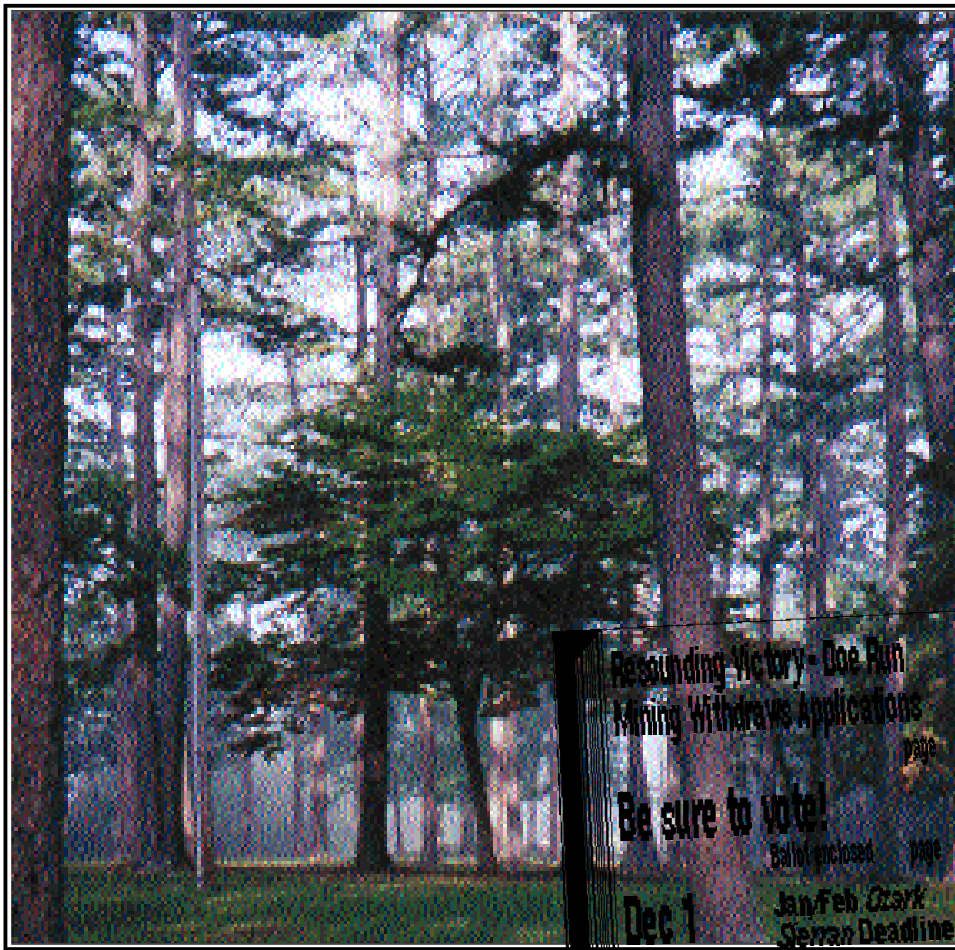
Campground, Buffalo National River, Arkansas