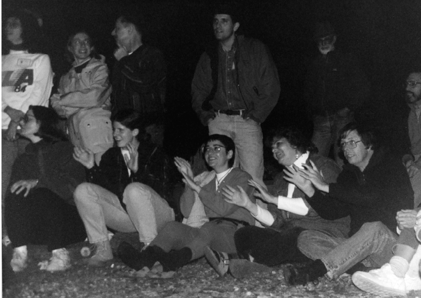
Campfire Sing Along

Check out the fun you'll miss if you fail to send in your registration form on page 9!