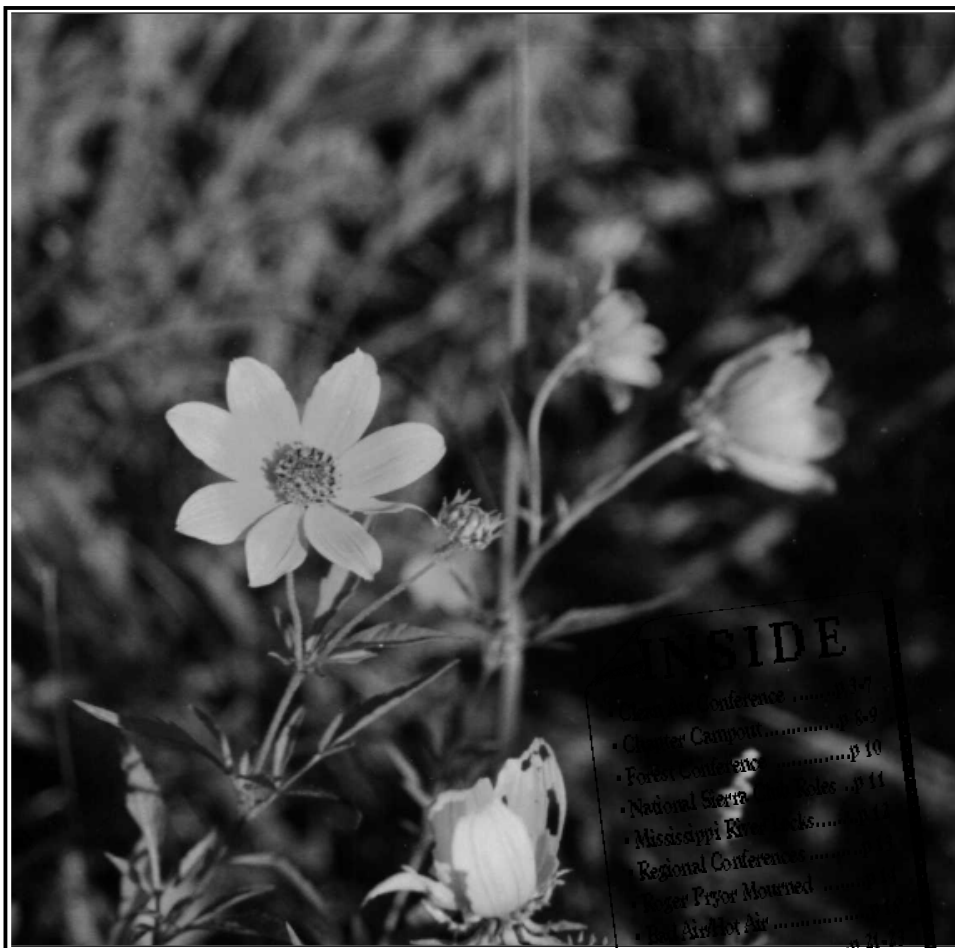
Tickseed Coreopsis; a Missouri native