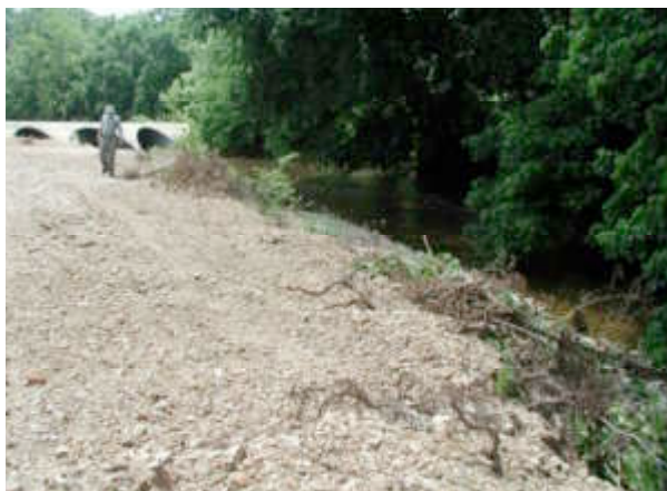
Sand and gravel operation on the upper Jacks Fork — note that this operation went right into the flowing water, but no violations were observed by Land Reclamation staff.

For one thing, the sand and gravel mining operations are responsible for stirring up polluted sediments — and fish don't exactly thrive in such waters. Canoeing and swimming in murky, polluted waters is not only no fun, it is downright dangerous. So, the fishing, canoeing and environmental/conservation groups are a bit up in arms about moves by the General Assembly and the State Land Reclamation Commission to lessen stream protec-