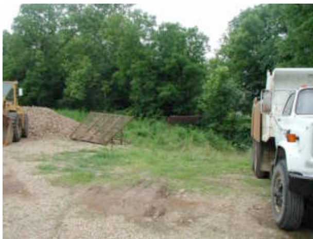
Sand and gravel operation next to Hwy 17 Bridge over Barron Fork of Tavern Creek. There are present: Frontloader, dump truck, two gravel screeners, and two large piles of sand and gravel. The investigator for Land Reclamation claimed that he saw none of this.

Not bad for a buncha guys on backhoes. 🙏