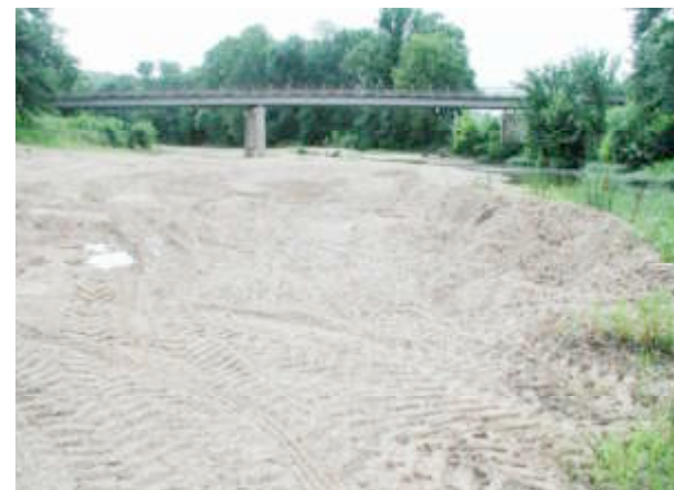
Sand and gravel operation on Tavern Creek just downstream of Hwy A (Miller County) bridge. Note water standing in the area of excavation indicating that it has been dug below the water level and had also operated within water channel. This site was deemed “personal use exemption” by MO Land Reclamation staff, even though it was over 100 yards long and took in the width of the gravel bar.

Contact the Chapter office (800) 628-5333 to get your copy of the petition and talking points. Let's be proactive in protecting MO streams!