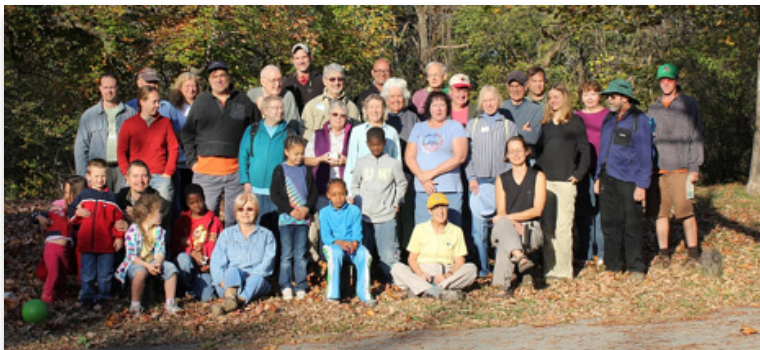
Sierrans at the annual Chapter Campout at Cuivre River State Park.

Foster Trail in Glencoe, MO. 5 easy, flat miles (can be shortened). Depending on weather conditions, holiday gathering after the hike. Contact Margot Kindley at margot107@charter.net