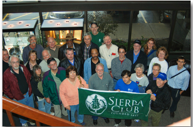
Tour at Milbank Manufacturing in Kansas City

The Missouri Sierra Club organized these tours in response to action by the MO General Assembly which curtailed the development of renewable energy in our state. During the 2011 session, the General Assembly overturned a Public Service Commission rule that would have required utilities such as Ameren to meet its 15 percent renewable energy standard (mandated under Proposition C that was passed in November 2008) by