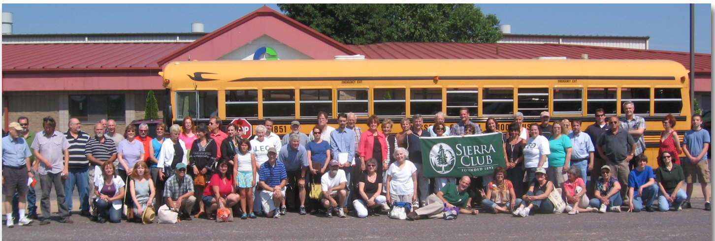
Tour at CG Power Systems in Washington, MO