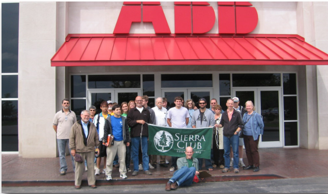
Sierra Club members at ABB in Jefferson City for a Green Jobs Tour. See page 1 for details