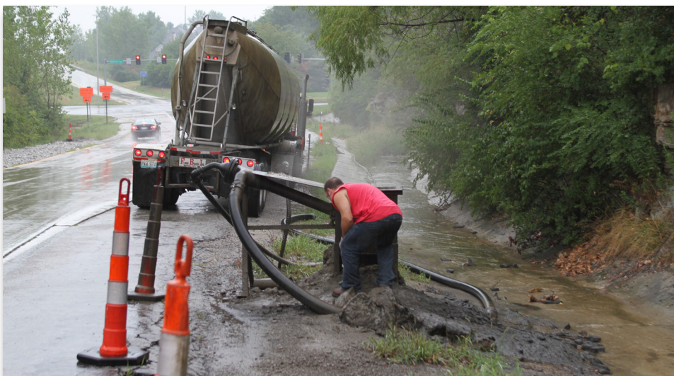
Coal ash being dumped in underground mines near Briar Cliff in Kansas City, MO