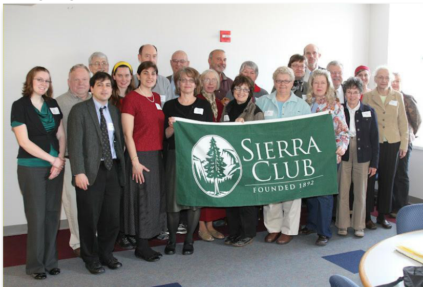
Sierra Club members in Jeff City for Lobby Day

This year's Lobby Day was on Leap Day Feb. 29th 2012. And thanks to the work of many people through Missouri Conservation and Environmental