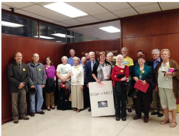
Sierra Club members were joined by members of the Ethical Society Earth Ethics Committee as well as members of Missouri Interfaith Power & Light at the St. Louis County Council meeting on October 15th. This was the 4th visit to the County Council where Sierra Club members have delivered over 2,000 petitions and letters calling for action to address coal pollution. During this visit attendees spoke out about the injustices posed by coal pollution and our moral obligation to act.