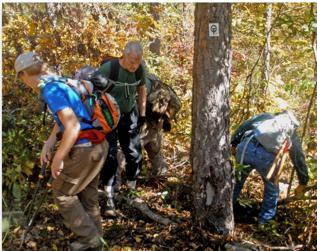
Trail Maintenance on Blair Creek, in October