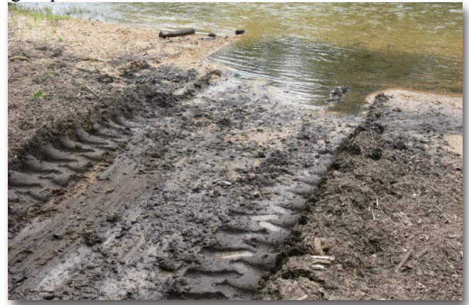
Tire tracks at the Ozark National Scenic Riverways

Another step you can take: when you visit the Current and Jacks Fork Rivers, be sure to tell your local outfitters (e.g. canoe rental, gas station, or lodge) that you support the stronger protections advocated by the NPS. Tourism is the biggest economic driver in the ONSR region, and so local outfitters share our interest in a well-man-