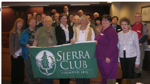
Osage Group Lobby Day