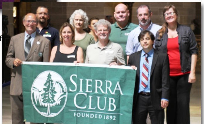
Thomas Hart Benton Group Lobby Day

In order to help you better evaluate your own and other members of the state Legislature, we are including in this newsletter our 2013-2014 Missouri Sierra Club Legislative Scorecard. We hope it will be useful during the upcoming elections and for any future interactions you may have with your elected leaders. If you do not know your State Senator and Representative, you can easily find out at: http://bit.ly/mo_leg_find