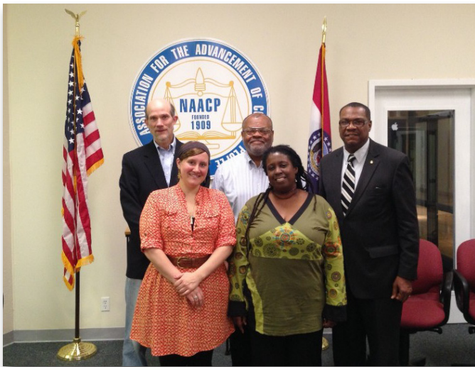
On April 3, the Sierra Club supported the St. Louis release of the new National Association for the Advancement of Colored People (NAACP) report on Just Energy Policies in Missouri. To read a copy go to http://bit.ly/NAACP_energy