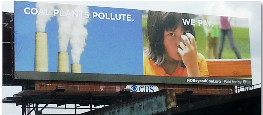
One of dozens of billboards in St. Louis sponsored by the Sierra Club