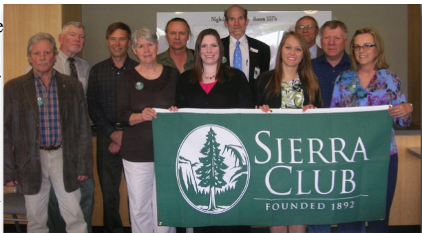
White River Group Lobby Day