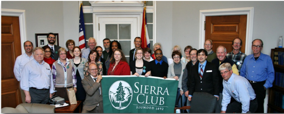
Eastern Missouri Group Lobby Day

of Natural Resources to enforce new EPA regulations on greenhouse gas emissions. Fortunately attempts to even