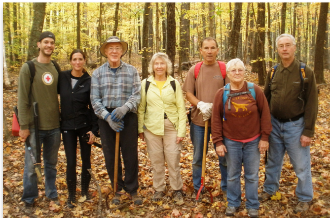
Ozark Trail Maintenance, October 2014