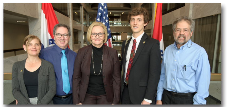
Sierra Club members meet with Senator McCaskill in Washington, DC