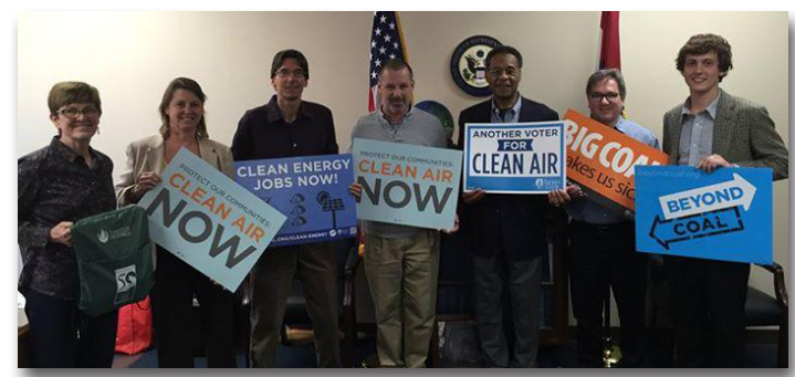
Sierra Club members meet with Congressman Cleaver in Kansas City