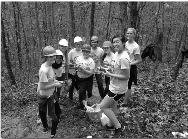
October Ozark Trailbuilding.

Jan 27 (Wed) Engelmann Woods Natural Area & Turkey Ridge Trail (Rockwoods Reservation). Engelmann Woods contains one for the few remaining