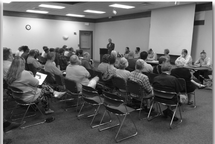
On August 26 Sierra Club members and supporters met in Springfield with representatives of Empire Electric utility to learn about solar rebates.