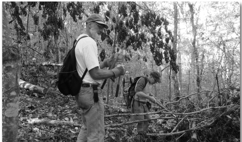
In October 97 people participated in a successful Ozark Trail week, with work completed on the Current River Trail, the Ozark Trail, the Laxton Hollow Trail and the Brushy Creek Trail.

gift.planning@sierraclub.org • (800) 932-4270