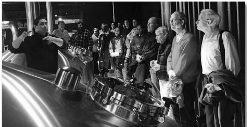
On October 27, members of the St. Louis Energy coalition tour the Urban Chestnut Brewery after learning about the importance of St. Louis County adopting modern residential energy efficiency building codes.

Another goal is to revive the Missouri Chapter Solar Committee. Solely economic considerations lend urgency to its task—considering the 30% federal tax credit for private solar installations scheduled to expire after 2016.