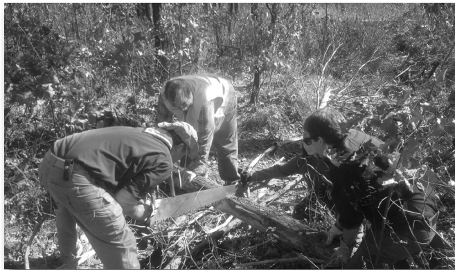
Trailbuilding at Hawn State Park.

Learn about trail building and trail protection. Discuss ways you can help save the