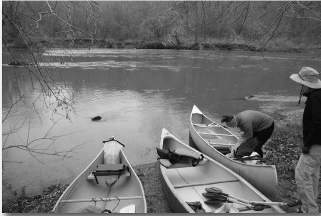
Young Sierrans Canoe expedition.

June 10 (Sat), Life Outside Festival 2017. Come to Creve Coeur Lake Memorial Park, North Entrance off Marine near boathouse. Come visit our booth and enjoy a hike in the park. You can then see, try and learn ways to spend more time enjoying the outside. Free activities include tree climbing, kayaking lessons, bird watching, rock climbing, stand up paddle boarding, nature crafts and activities for kids, walks and bike rides throughout the day, gardening and yoga. Four musical groups provide additional entertainment as well as food and beverage trucks to make your visit a fun experience for you and your family. Contact Doug Melville, 636-288-1055 or douglas.k.melville@gmail.com or http://greatriversgreenway.org/life-outside/