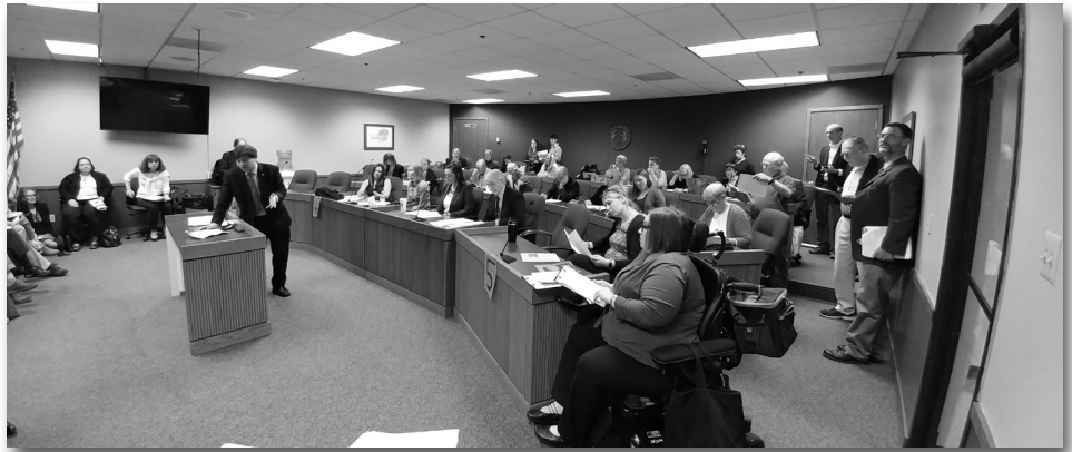
On April 12, Sierra Club members from around the state came to Jefferson City to talk with legislators about environmental issues. Here they have packed a Capitol hearing room for the day’s orientation.

Two social equity bills we oppose did pass and are awaiting a decision from the Governor. Please contact Governor Greitens at 573-751-3222 to request a veto on SB 43 and HB 1194. SB 43 makes it more difficult to sue and successfully prove that discrimination was the cause of losing a job. HB 1194 means that no city can have a minimum wage higher than the Missouri state minimum wage and overrides the higher wage that was to effect in St. Louis this year. The Sierra Club is committed to a more equitable Missouri, in accord with national Sierra Club policy. You can learn more at sierraclub.org/equity .