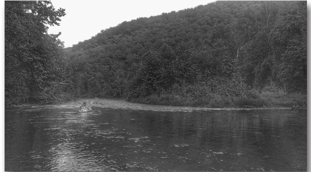
Eleven Point River.

Thank you for saving the Eleven Point State Park!