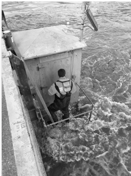
Missouri stream gauge is checked by staff. River forecasting is vital to the protection of life and property.