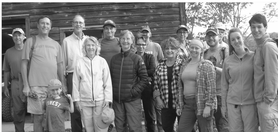
Trailbuilding at Current River State Park.