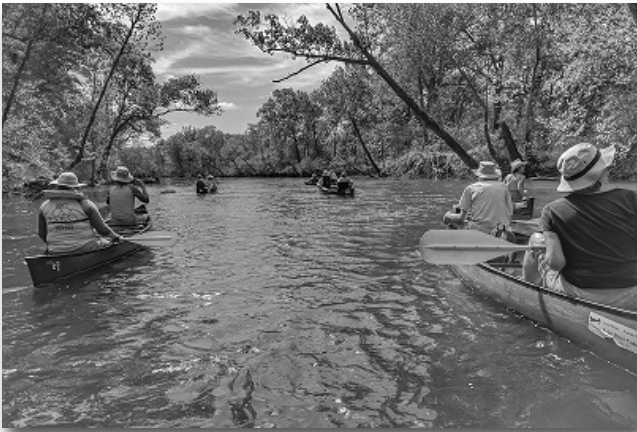
Sierrans canoeing on the Eleven Point River.

Feb 7 (Wed) Creve Coeur Lake County Park. This time we will hike the Bootleggers Run Trail that winds around the forest on