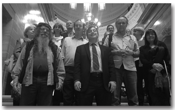
Western Missouri Lobby Day, April 18