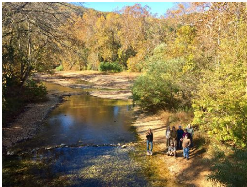
White River Group Hike at Busiek State Forest.