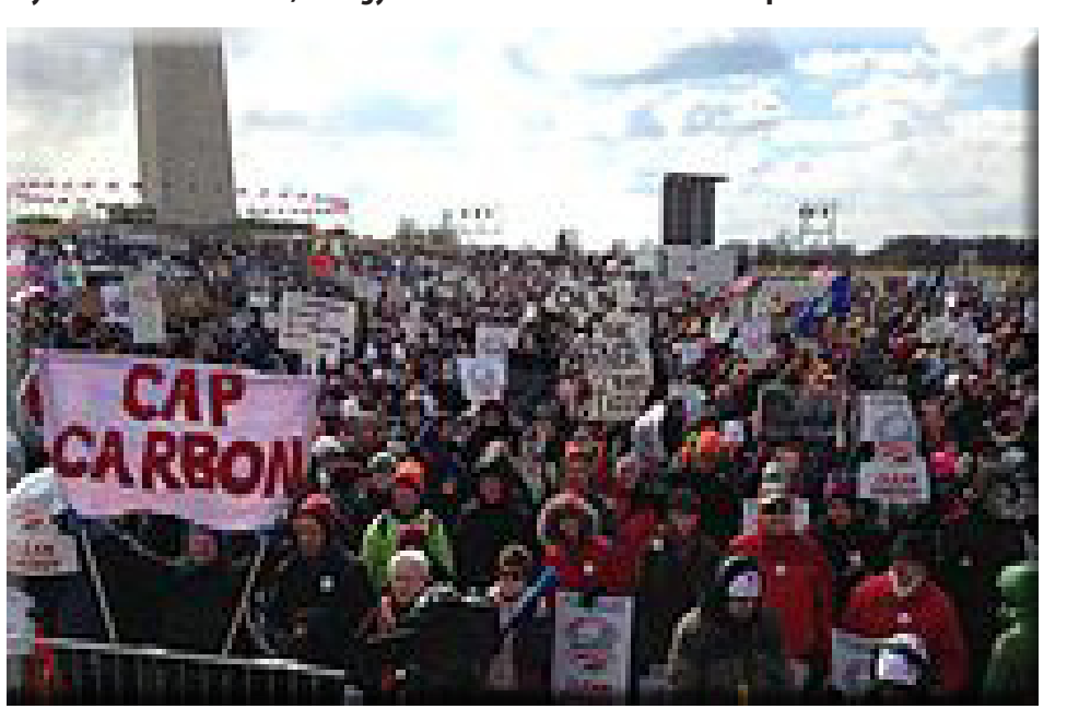
An estimated 40,000 gather in Washington D.C. on February 17, 2013, to protest the Keystone XL Pipeline and support action on climate change.**