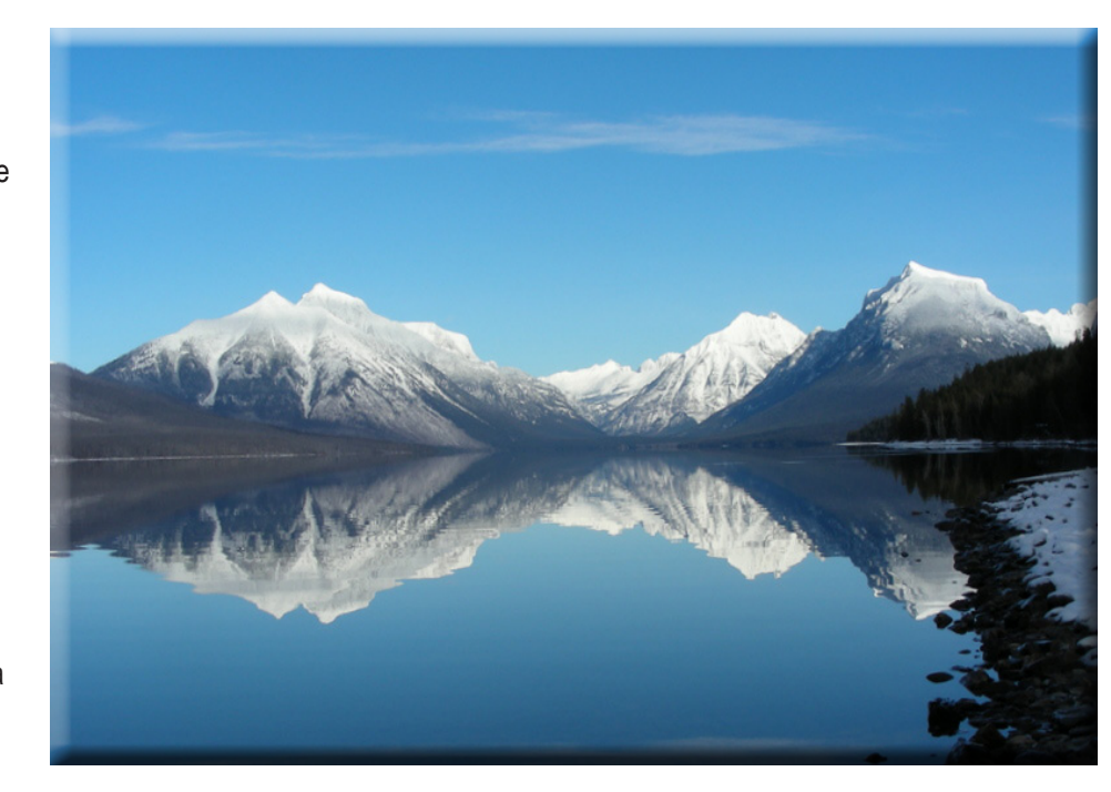
Snow-Capped Mountain Peaks Reflected in Lake MacDonald, Glacier National Park