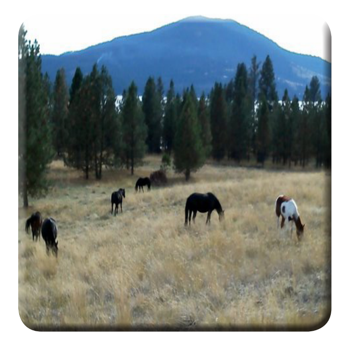
Feral Horses on Wild Horse Island, Flathead Lake