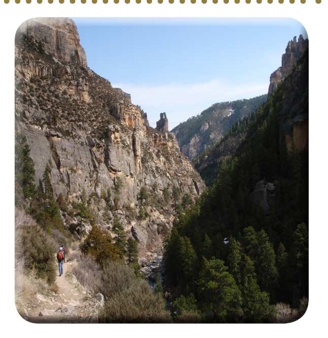
Upper Tongue River Canyon in the Bighorn Mountains near the Montana/Wyoming Border