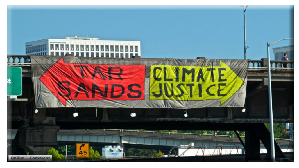
For the health and survival of our planet and our children's children, there's only one choice. Photo Credit: N/A

With bituminous oil having close to doubled the CO2 footprint compared to traditional crude, exploiting these fossil fuels is nothing short of dangerous. NASA's Jim