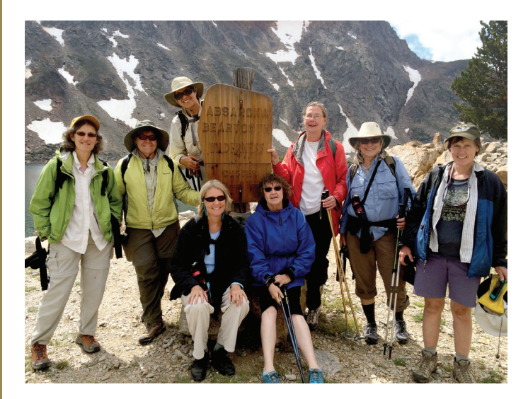
Glacier Lake in the Absaroka-Beartook Wilderness Area.