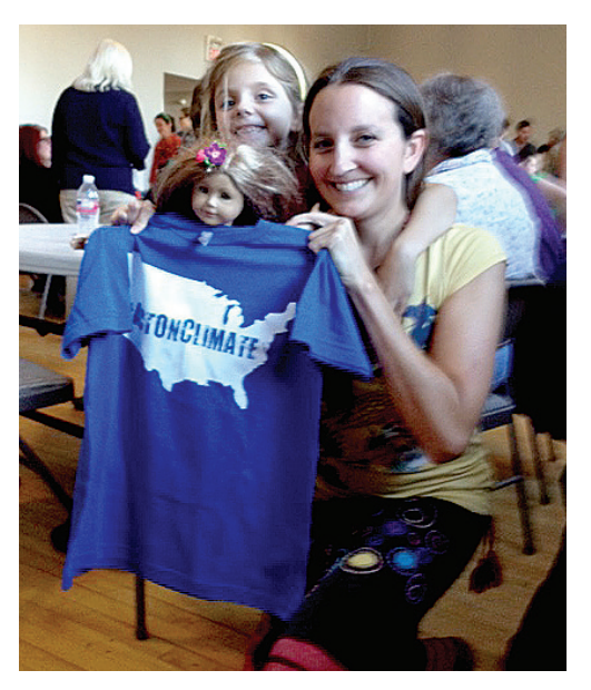
September 5th in Bozeman – happy to support action on climate change!

The reduction goals in the CPP are relative to a 2005 baseline of emissions. The standards started with each state's 2012 energy mix to set that state's goal. These include improving energy efficiency, improving power plant operations, and encouraging low-carbon and zero-emitting electricity generation. Together, these make up what the EPA defines as the best system for reducing carbon pollution. The EPA applied these strategies consistently across every state, but each state's energy mix ultimately leads to a goal