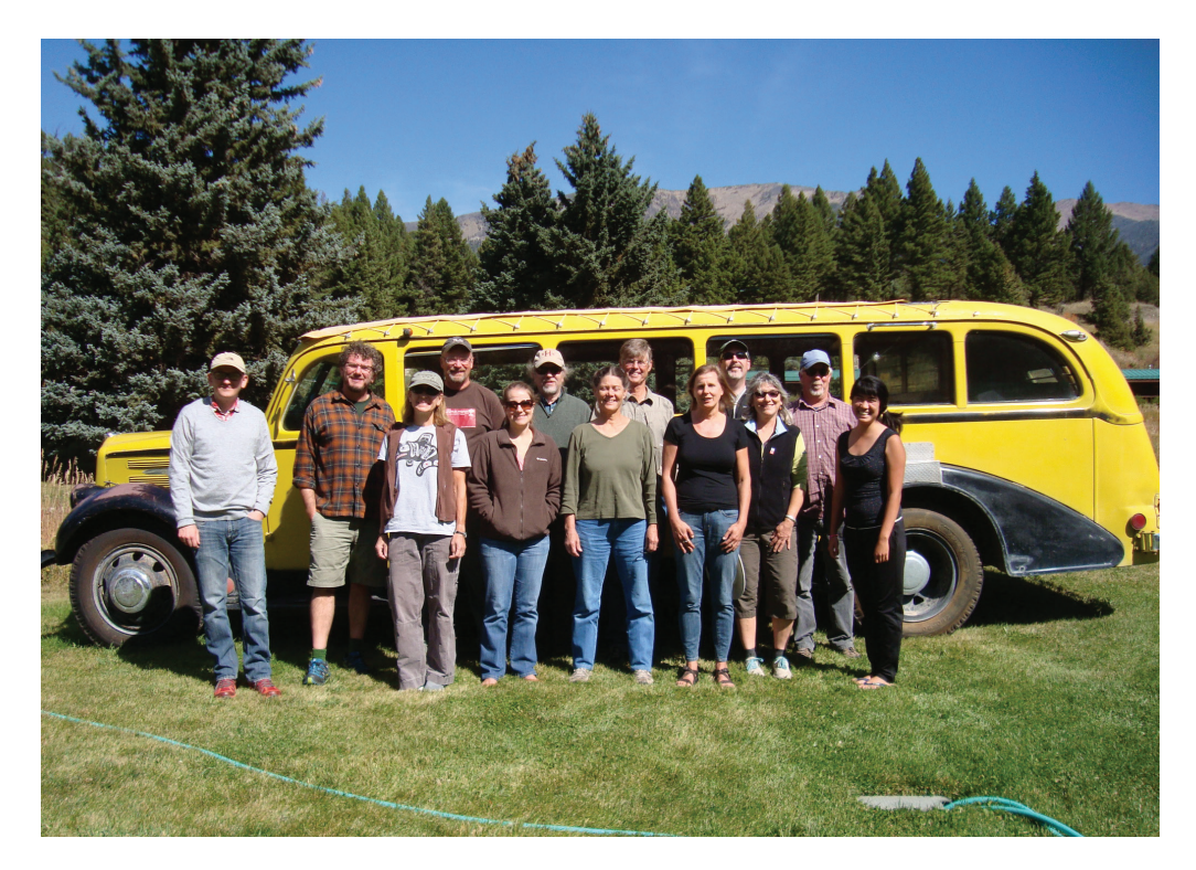
Greater Yellowstone Ecosystem Retreat Participants

For example, the Gallatin Range is the biggest roadless area adjacent to Yellowstone lacking permanent protection. As Bozeman's premier recreational playground, it faces serious problems with maintaining environmental quality and wilderness characteristics. There is widespread public recognition that recreation, wildlife, and scenic beauty are powerful drivers for Bozeman's economic development but these, in turn, are all being threatened by such