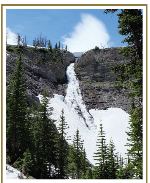
The waterfall from Our Lake along the Rocky Mountain Front.