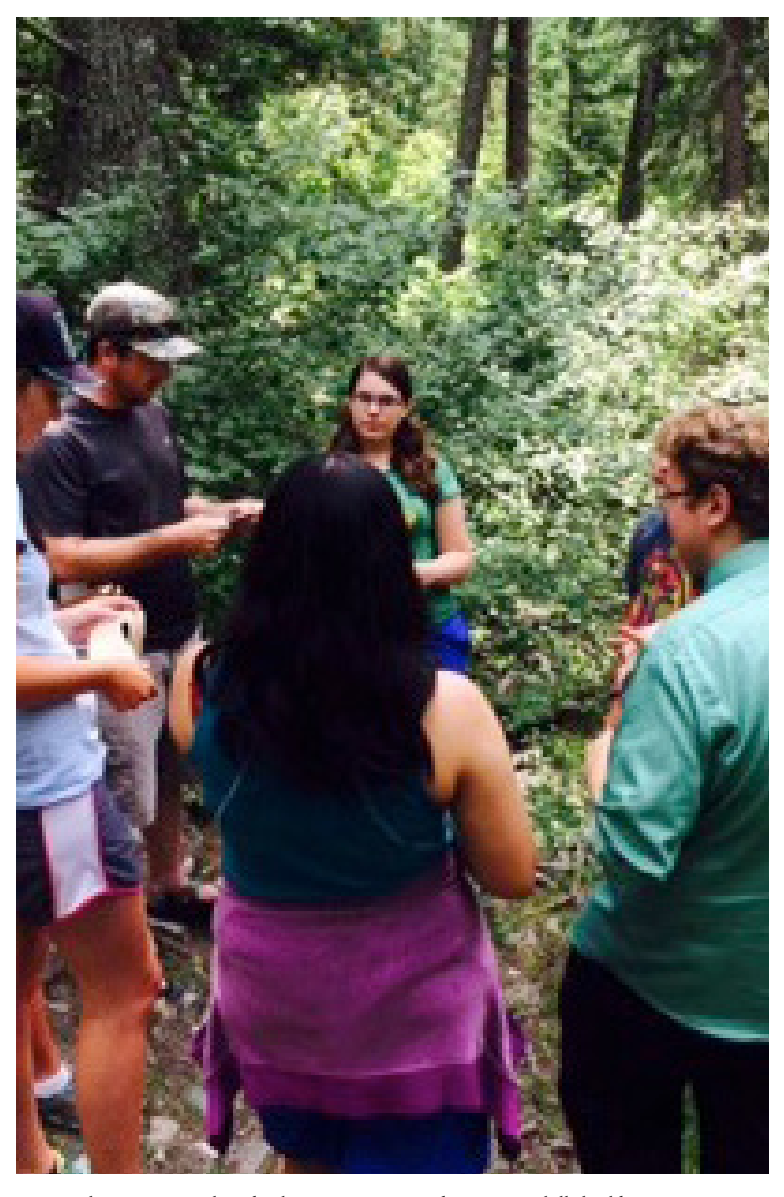
During the outings youth and volunteers participated in creative skills-building activities focused on leadership development and team building.

As their confidence and enthusiasm grows, local youth are being encouraged to take ownership of the program by becoming part of our planning team to help organize future outings as well as recruit their peers during the upcoming hiking season. We also hope to build on our initial success by offering other experiences involving a wider network of volunteer mentors, to deepen participants' connection with the outdoors, inspire dedicated stewards of wilderness, and create an enduring desire to protect our wild spaces.