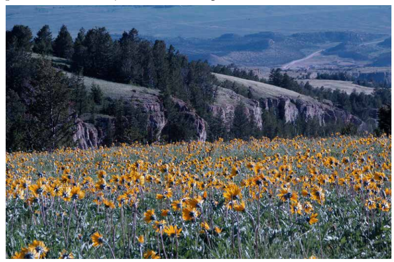
Upper King Canyon, photo credit: Dick Walton.

Fortunately, this special area has dedicated and hard working advocates in The Pryors Coalition, "a group of local folks working to pass on the natural beauty and quiet of the Pryor Mountains for people to enjoy today and tomorrow." To learn more or to become involved, please visit www.PryorMountains.org