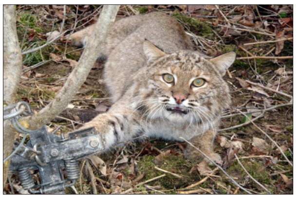
Bobcat caught in a leghold trap.

FOR THE SIERRA CLUB POLICY SEE: https://www.sierraclub.org/sites www.sierraclub.org/files/uploads-wysiwig/Trapping-Wildlife.pdf