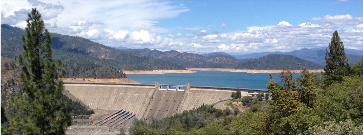
Federal officials say adding 18.5 feet to the top of Shasta Dam would enlarge the reservoir's capacity by about 14 percent.