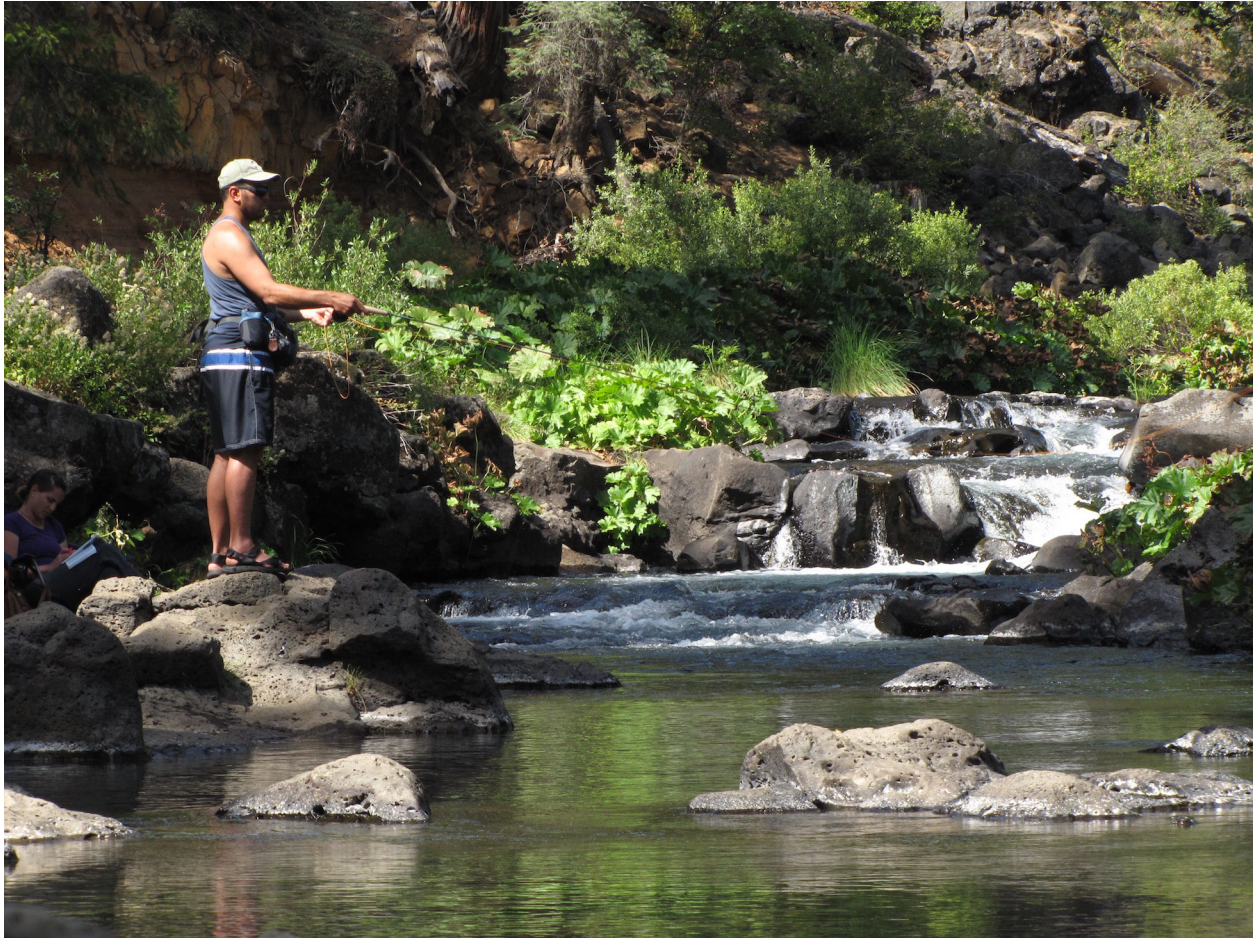
The McCloud River is a legendary trout-fishing stream and sacred grounds for the Winnemem Wintu tribe. It's protected under state law.