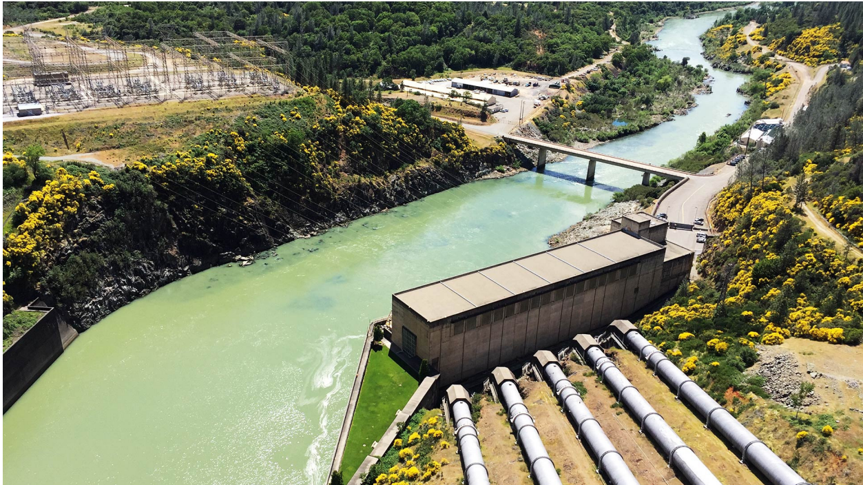
Federal dam operators say that a deeper reservoir would allow them to send more cold water downstream, to support salmon in the Sacramento River.