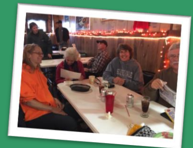
Otter Lake Hike recovery and mingle time.

Come make friends and memories with us, we are eager to share what we know and a love of nature.