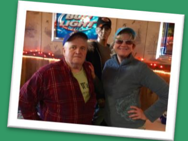
Recruiting at the Otter Lake and Grill after our hike.