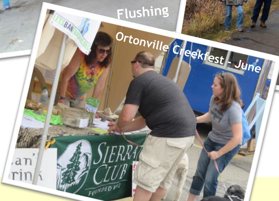
Ortonville Creekfest - June