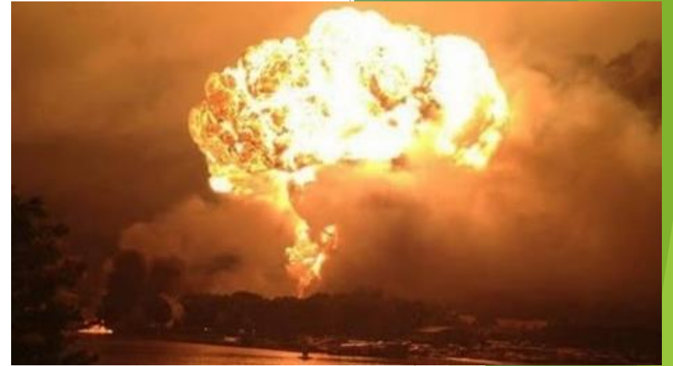
Lac-Mégantic rail disaster killed 47 people