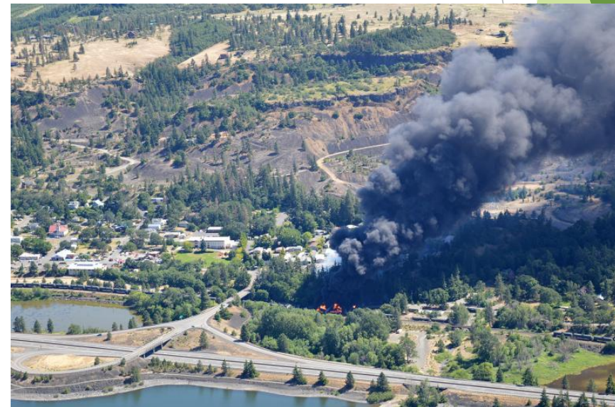
Moiser, OR train derailment June 3 rd 2016