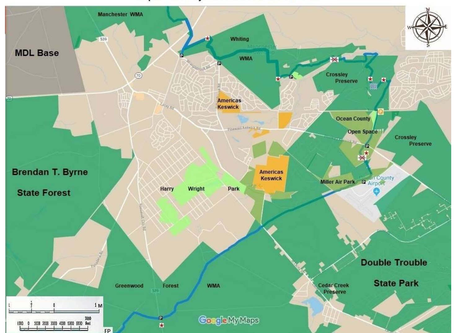
Map 20 Crossley Preserve-Greenwood Forest

The southern 14 miles of the Cedar Creek Trail are part of the 383-mile long NJ State Long Trail.