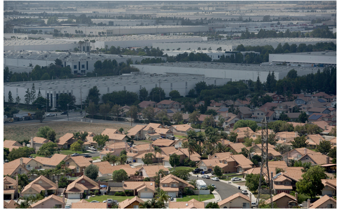
A vast industrial area that includes numerous logistics facilities near homes in Rancho Cucamonga and Fontana.

The South Coast AQMD is responsible for improving air quality across Los Angeles, Orange, Riverside and San Bernardino counties. The region has some of the nation’s worst smog, largely driven by warehouses and trucking emitting lung-damaging soot.