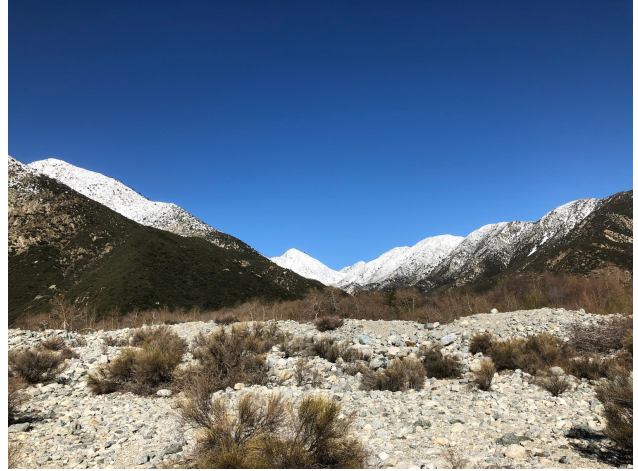
Lytle Creek wash near where the construction is happening.

For many generations, the North, Middle and South Forks of Lytle Creek have been a traditional and popular recreation destination for families in the surrounding areas including San Bernardino, Fontana, Rialto and Colton. Along the shaded streams, families enjoy water play, fishing, and picnicking along the canyon bottoms of the Middle and North Forks. The area provides a much-needed respite from the hot and smoggy days of summer.