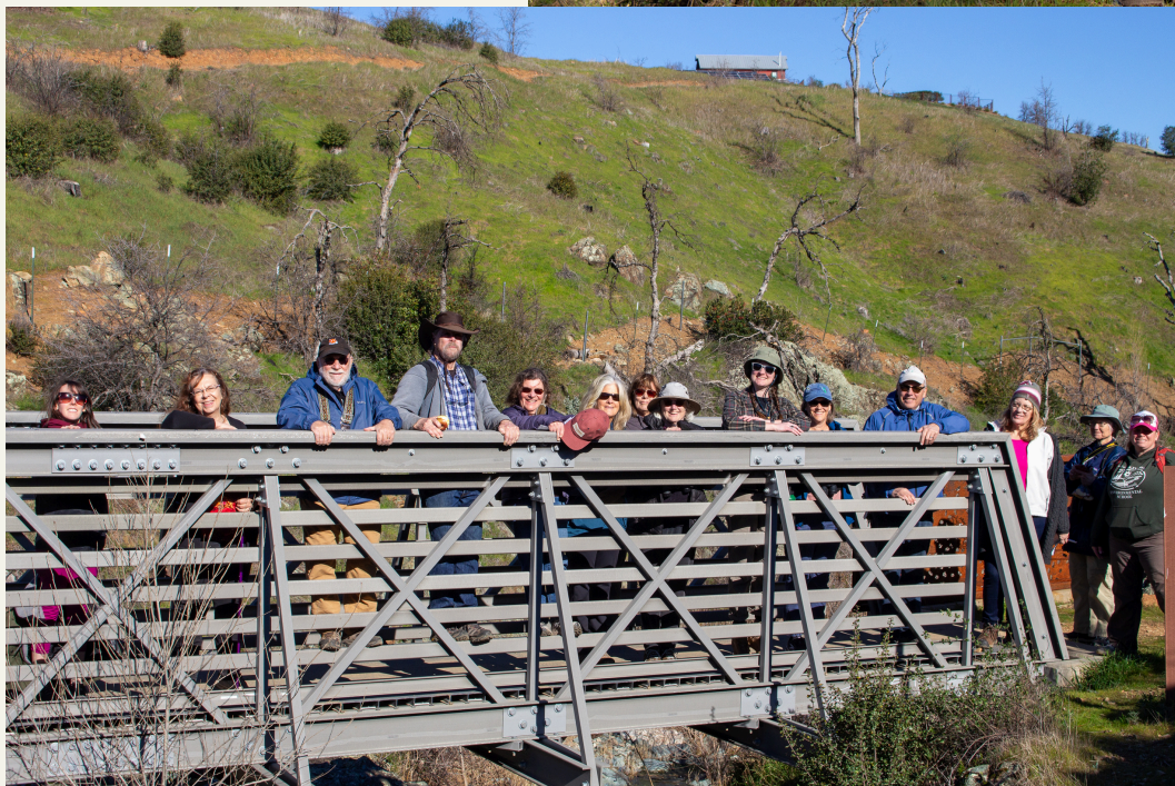
Looking out over one of the bridges along the trail!