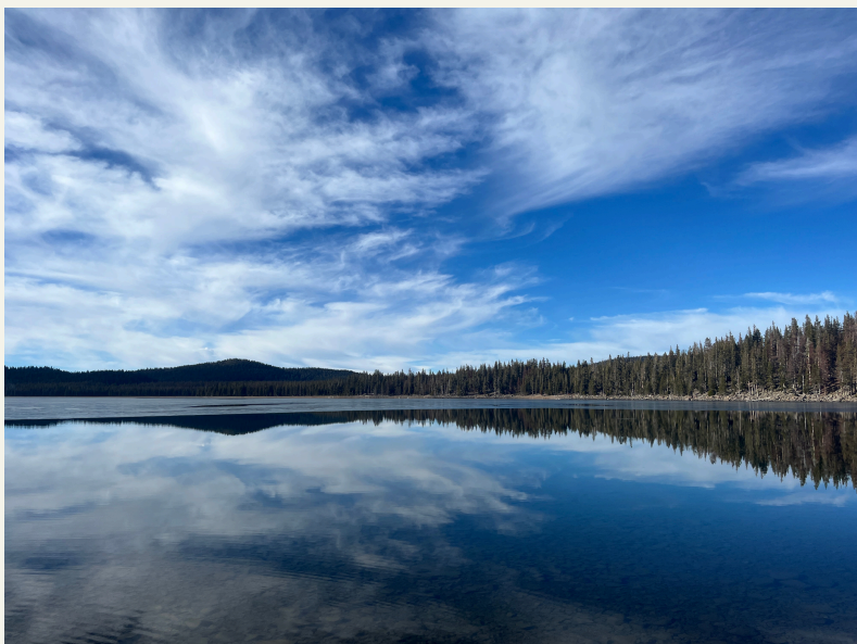
Medicine Lake in S attitla Highlands National Monument

This should be a fascinating talk by those who are intimately knowledgeable about the area and the long battle to obtain National Monument status. Whether you are familiar with the area or not, this will be an important opportunity to learn the importance of protecting the area.