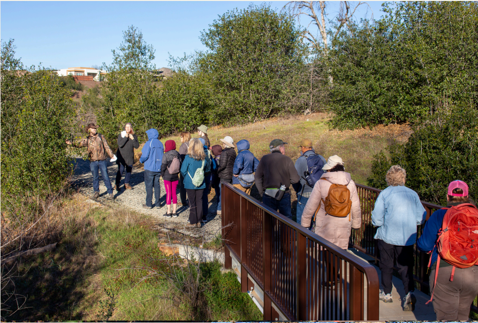
Hiking participants on the trip!