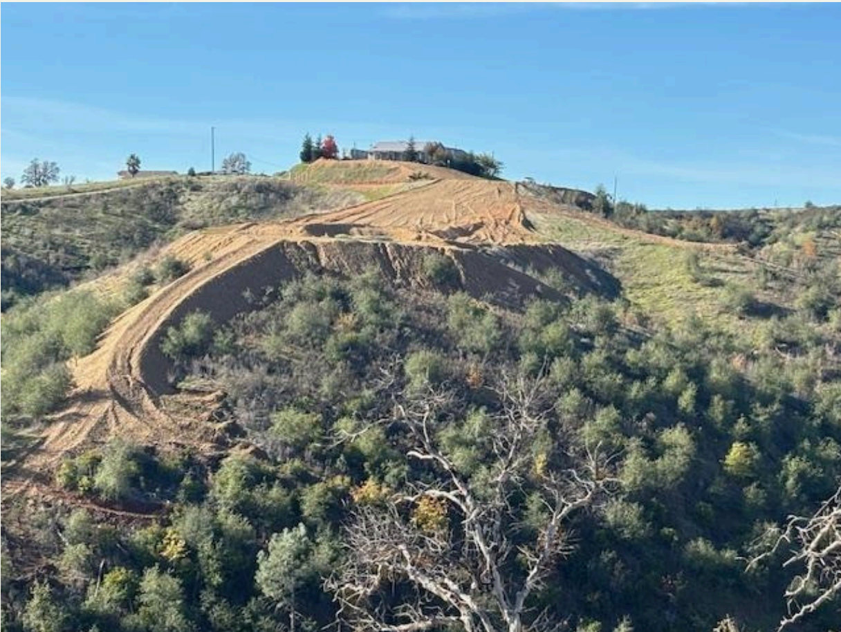
This photo of the unpermitted gun club property grading was taken by a hiker from the BLM property before the heavy December rain storm that caused area erosion.

The illegal bulldozing has caused erosion into an intermittent stream during a heavy December storm as well as sedimentation coming from runoff from erosion on County property below Clear Creek Road all of which runs into Clear Creek at the Horsetown Clear Creek Preserve. The illegal grading can be seen from Clear Creek Road near Cloverdale Road. Restoration of the Clear Creek fishery below Whiskeytown Dam has been ongoing over a 20+ year project by many agencies with much of the work largely coordinated by the US Fish and Wildlife Service.