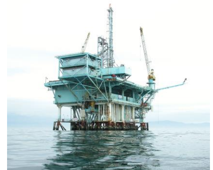
Oil platform similar to the Saratoga that sunk in 2004.

If you are wondering what had been done during the 14 years since 2004 when the oil platform was toppled by Hurricane Ivan, the details are sketchy. Taylor Energy originally reported the leak as being 12 barrels per day. Subsequent investigations produced higher rates and were disputed. In 2008, Taylor Energy sold out to Korea National Oil Corporation in partnership with Samsung C & T Corporation. Taylor ceased all drilling and oil production. Ten more years passed and the leakage was reported to be 700 barrels per day . If it was at that rate for the full period, this spill would be close to that seen by the BP Horizon disaster.