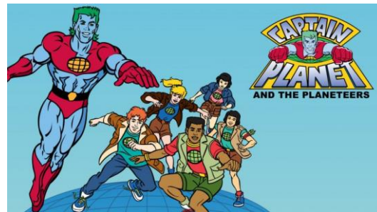
Captain Planet (together we can make it happen!)

The “New Deal” designation heralds back to Franklin D. Roosevelt’s social and economic program that created jobs and helped workers pull our country out of the Great Depression in the 1930s. The GND has a focus on reducing carbon emissions, creating clean energy jobs, and calls for economic, health and education equality. The details have not all been worked out, but the timelines cited are aggressive (10-12 years), recognizing the urgency of our situation. This is a tall order.