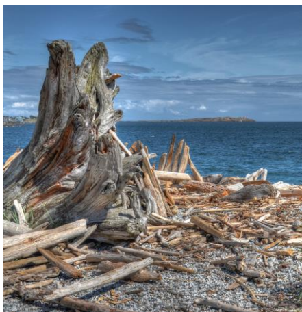
Driftwood – A tree set free.

Oct 23 – The Story of Water at Sequim City Hall Council at 6:30 PM